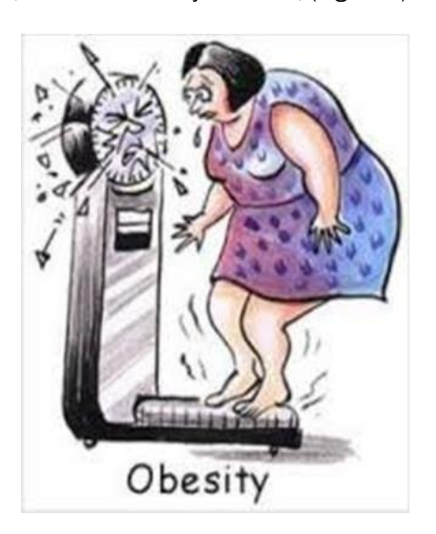
Figure 1: Obesity

Obesity may be defined as abnormal growth of adipose tissue or fat cells that is enlargement of fat cell size (Hypertrophic obesity) or increase in fat cell number (Hyperplasic obesity) (1-5). Obesity is a multisystem disorder which involves respiratory system, cardiovascular system etc., (Figure 1).