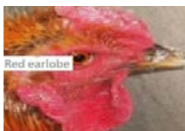
Figure 4. Some Earlobe color of indigenous color.

The result indicated that predominant observed eye color was orange color in both study area. While brown, yellow, blue, and red were observed least proportion. The overall predominant eye color was orange (96.4%), while brown (1.8%), red (0.7%), blue (0.7%) and yellow (0.4) color was observed in least diversifying in study area (Figure 4 and Table 4). The study indicated that the predominant observed feather distribution was normal feathered in both study area. Local chicken as observed were mostly normal feathered, but no necked neck chickens. Feathered shank and feet chickens were hens (1.7%), cock (1.1%).