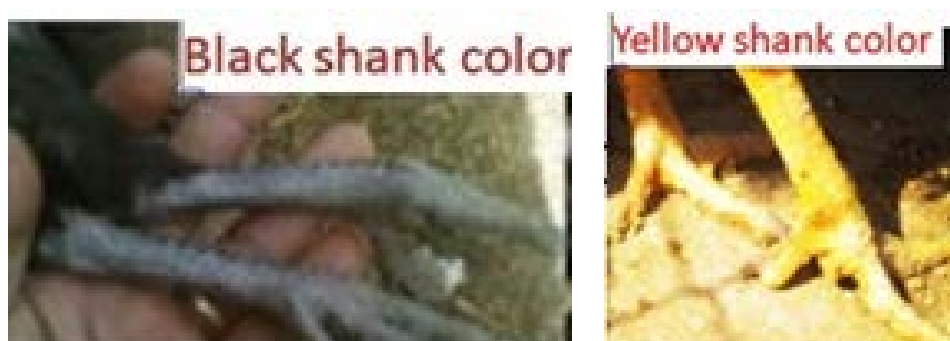
Figure 5. Some shank color of indigenous chicken.