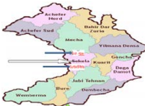
Figure 1. Showing Location of the study area on map, Source: Sekela Woredas Maps in West Gojjam (2006).

Description of the study area: This study was conduct in Sekela Woreda of West Gojjam, Amhara Regional state of Ethiopia on two Kebeles, namely, Surba Bifeta and Gish Abay. Sekela Woreda is located at 459 km North West of Addis Ababa, the capital city of Ethiopia. It is located 160 km South East of Bahir Dar, the capital of Amhara National Regional State (Figure 1).