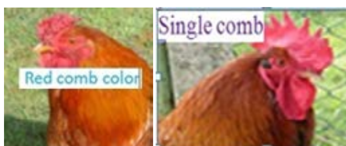
Figure 3. Some Comb color and patterns of indigenous chicken.