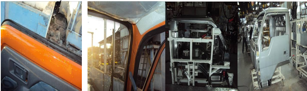
Fig.1: Water Leakage from Doors Fig.2: Water Leakage from Front Wind Shield Fig.3: Door Mounting on Cabin Fig.4: Door Ring Assembly Fixture

Water leakage problem is basically related to door gaps and door ring dimension which comes during joining of different sub assembly.