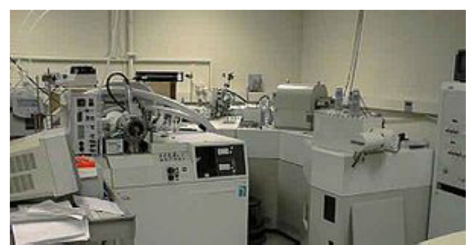
Figure 1. A five sector mass spectrometer.

A popular combination of these sectors is Bagnetic-electric-magnetic (BEB). Most modern sector instruments are doublefocusing instruments in which ion beams focus is controlled for its direction and velocity <sup>[6]</sup>. The behavior of fragmented samples in ionic form is important in any MS technique. It depends on a homogeneous, linear, static electric or magnetic field (separately). For example, as is found in a sector instrument (Figure 2). Like other MS, the sector based MS is also governed by two laws. One