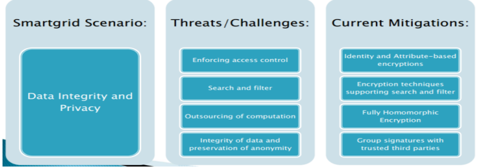
Figure 8: Cryptographically Enforced Access Control and Secure Communication.

There are two approaches to control the visibility of data to diverse entities, like systems, individuals and organizations. The first approach organizes the visibility of data through restrictive access to the principal system, for instance the OS (Operating System) or hypervisor. The second approach encapsulates the data itself in a defensive shell by means of cryptography. Both approaches enclose their remuneration and detriments. In the past, the first approach is simpler to execute and, as united among cryptographically-protected communication, be the standard on behalf of the preponderance of computing and communication infrastructure.