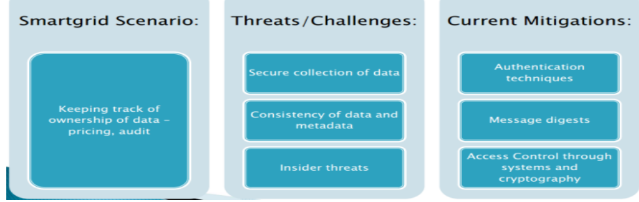
Figure: 11 Data Provenance.

Provenance metadata will mature within complexity attributable to great provenance graphs generate from provenanceenabled programming environments in big data application. Analysis of provenance graphs detects metadata dependency for security and/or confidentiality applications are computationally intensive.