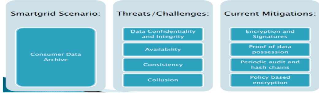
Figure 4: Secure Data Storage and Transaction Logs.

While the data and transaction logs be capable of stored and managed across different storage media physically, the amount of such data means to facilitate computerized solutions are fetching more customary. Consequently such computerized solutions could not trail wherever the data is essentially stored introduce challenges within the application of security. For example, data is not often used to store on cheaper storage, on the other hand but this cheaper tier do not contain the equal security controls and the data are susceptible, subsequently a risk is introduced. Subsequently organizations ought to guarantee so as to their storage approach not merely consider the reclamation rate used for such data, excluding the warmth of data.