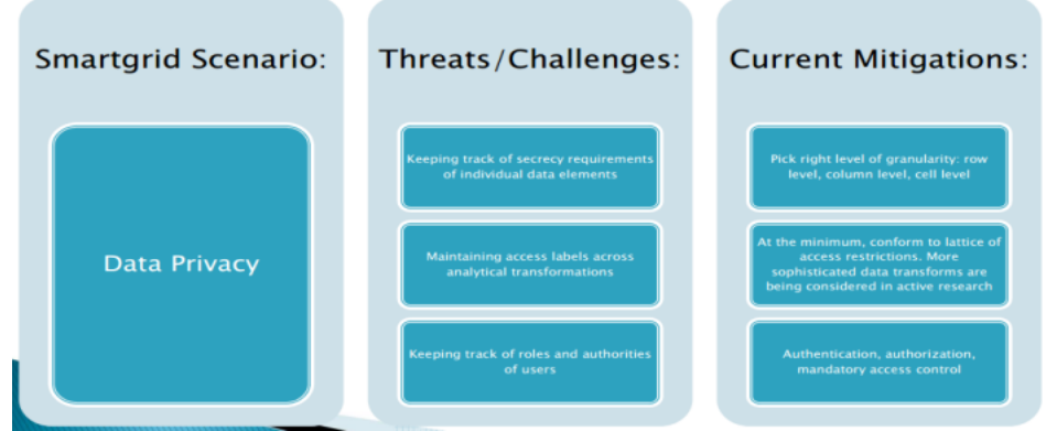
Figure 9: Granular Access Control.

not enclose access. The crisis with course-grained access mechanism is that information might otherwise be shared is regularly swept into a more preventive classification to ensure sound security granular access control gives data managers a scalpel rather than a sword to share data as much as possible without compromising secrecy.