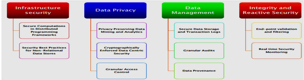
Figure 1: Top 10 Big Data Security and Privacy Challenges 4.

It consists of two phases. One is called the Mapper phase, which split an input file into various chunk. This phase stores key – value pairs, read the data and achieve some estimation. Another is Reducer phase, combine the values belong to every different key and output the end result. Attack prevention measures are majorly two types: securing the etiquette and securing the information in the occurrence of an untrusted way.