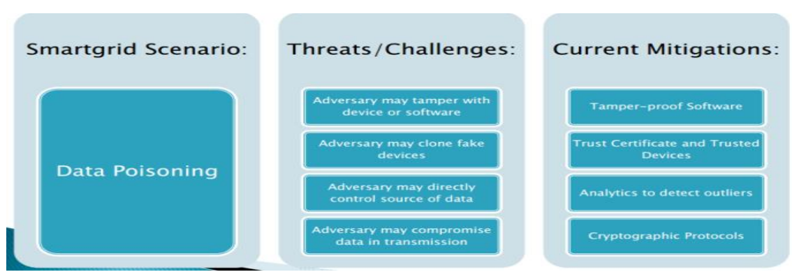
Figure 5: End Point Input Validation/Filtering.

A Big Data accomplishment is expected to assemble data from a large amount of sources but the confront will be attributing the level of trust associated with the data provide from such sources. Many big data use cases in enterprise setting necessitate information gathering from a few sources, like end-point devices. For instance, a SIEM accumulate event logs from millions of hardware devices and programming applications in an enterprise network. Data accumulate since a diversity of dissimilar sources. Thus it becomes fundamental to confirm the data itself along with the basis of data. What is the level of conviction of the data, what mechanism to utilize to confirm the foundation of the data is not spiteful, and how to eliminate spiteful data as of the accumulated data is a key dispute?