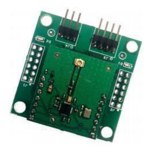
Figure 2: WiSense Node –courtesy WiSense [7].

Copyright to IJAREEIE DOI:10.15662/IJAREEIE.2015.0501001 1112