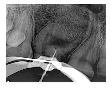
Figure 3B. Intraoperative radiographs depicting cleaning and shaping procedures with Waveone primary instrument.