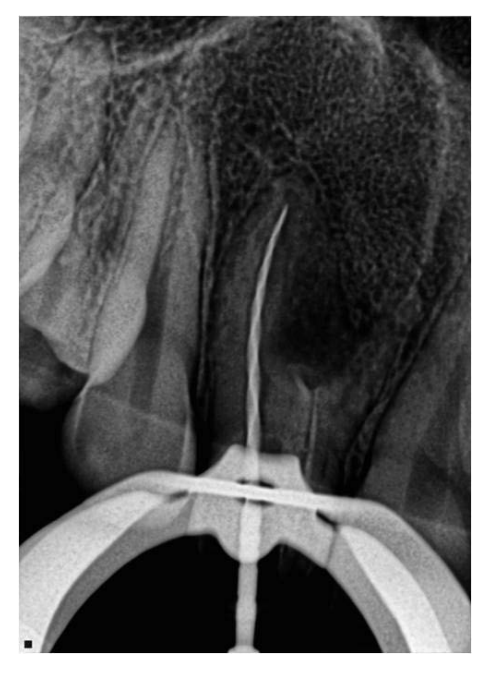
Figure 3A. Intraoperative radiographs depicting cleaning and shaping procedures with Waveone large instrument.

The access openings were temporized with Cavit (3M ESPE, St. Paul, MN-USA). The patient was referred to her general practitioner for permanent restoration. After one year, the patient returned asymptomatic, the tooth was functional and had no sensitivity to percussion or palpation. The radiographic assessment of the tooth showed significant osseous healing of the preoperative lesion ( Figure 3C ).