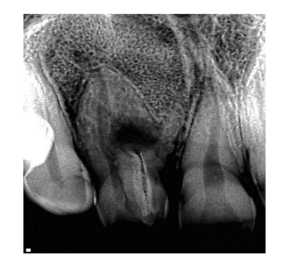
Figure 1B. Periapical radiographic examination.

A CBCT scan was performed with an I-CAT apparatus (Kavo-Kerr, Joinvile-SC, Brazil). The images revealed a periapical radiolucency which was larger than that observed radiographically (Figure 2). The diagnosis of Oehlers type 2 DI with pulp necrosis and a chronic apical abscess was established for the maxillary right lateral incisor.