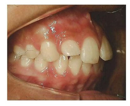
Figure 1A. Intraoral clinical examination.

Radiographic evaluation revealed an invagination into the pulp chamber of the tooth, and there was periapical radiolucency. Two canals were visualized: the main canal located distally, which tapered progressively toward the apex, and an invaginated canal located mesially and separate from the main root canal (Figure 1B) .