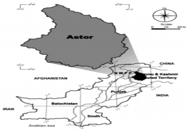
Figure 1. Astore Water Shed.

In this study Astore watershed is selected to determine the uncertainty in the prediction of rainfall [6] . The Astore watershed is located in Pakistan having longitude and latitude 35° 33' and 74° 42' respectively, having a catchment area of about 3990 km 2 Figure 1 . There is only one gauging station installed by Pakistan Metrological Department having an elevation of 2168 m.a.s.l.