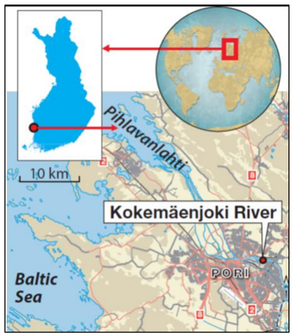
Figure 1. Location of the study area.

estuary is proceeding very quickly due to the deposition of sediments carried by the River Kokemäenjoki, the accumulation of autochthonous organic (plant) matter, and due to land uplift, typical to the shores of the Baltic Sea. At present, the extent of the land uplift in the area is 5.5 millimeters a year. The deltaic deposits (formation of new sandbanks and islands), as well as the distribution of the vegetation zones are today moving towards the sea at the average speed of 30 meters a year (Aulio, 1979).