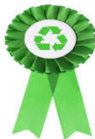
Fig 1: I am with Green

Green management is a social corporate responsibility for today's corporate world due to many reasons affecting the mankind and environment. We know that the core business models keep on changing with trend in technology globalization, demographics and other factors will influence organizational structures and cultures. Many studies have been undertaken to explore the future of society, the environment, business and even the workplace. Our challenge was to focus explicitly on the implementation context and the impact on people, their work and systems that make the goal achievable. The major challenge is people management and knowledge to incorporate the system effectively with change management in people attitude and acceptance permanently. Companies develop a powerful social conscience and green sense of responsibility. Consumers demand ethics and environmental credentials as a top priority. Society and business see their agenda align.