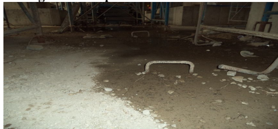
Figure 4: No Vertical Opening in the site