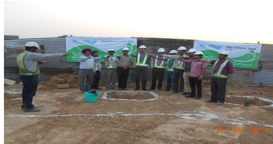
Figure 5: Proper utilization of Environment Day