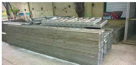
Figure 2: Proper storage of H-Beam