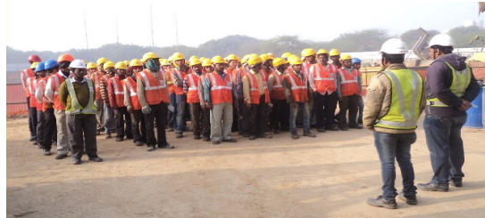
Figure 3: Proper Professional Motivation