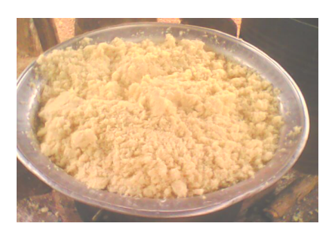
Figure 7. Attieke.