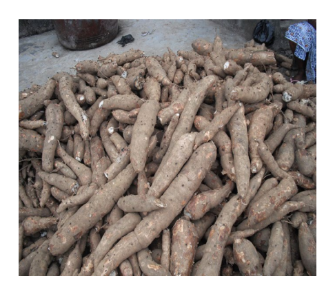
Figure 1. Cassava roots.

The used plant material consisted of 12 months-old freshly harvested cassava roots of the bitter variety, IAC cultivar (Improved African Cassava) (Figure 1).