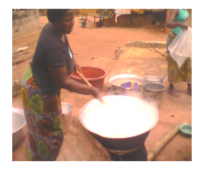
Figure 6. Cooking of semoulas.