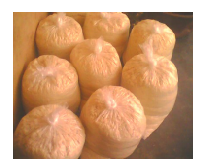
Figure 8. Attieke packed.