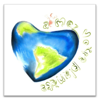
Figure 5. Graphic research.