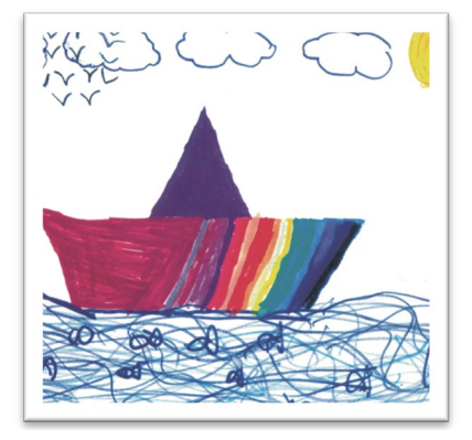
Figure 1. Children drawing.

In this survey, a child centred participatory approach is used. Enabling children, as much as possible to be involved in all design process, including giving them a real choice of how and when to participate. The drawings achieved by the children and their faculties of analyses and syntheses were used as inspiration source like presented in the following (Figures 1 & 2).