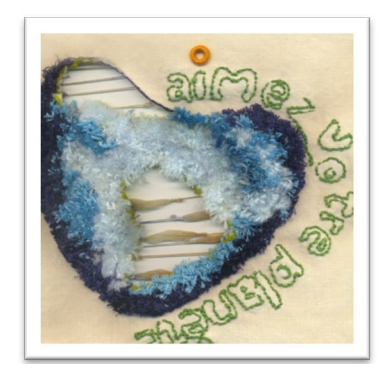
Figure 6. Textile research.