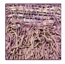
Figure 10. Textile model created by irregular weaving.