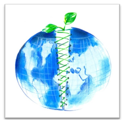
Figure 4. Graphic research.