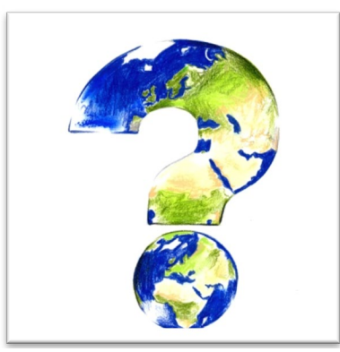
Figure 3. Graphic research.

The Figures 3-6 represent some of those researches.