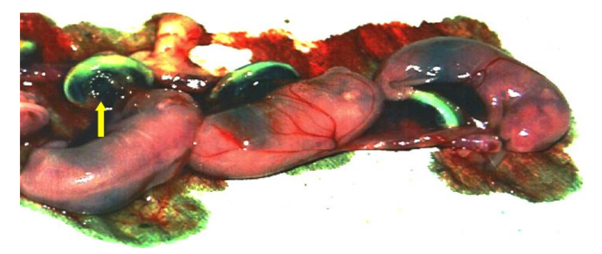
Figure 2. Image of three fetuses from the Very High Dose Group (VHG). Note: the discoid placentas and the altered color of the edges of the placenta (arrow)

These modifications suggest the presence of a more intense inflammatory event in this group. Taking into consideration the known histology of the rat placenta, microscopic evaluation revealed seven abnormalities in the HG and VHG groups on the 20<sup>th</sup> day of pregnancy. These abnormalities consisted of: 1) thickening of the external zone; 2) an increase in the uterine sinus; 3) leukocyte infiltration; 4) large vacuoles; 5) presence of fibrin in the external surface; 6) predominance of a mononuclear morphology in vesicular cells; and 7) fewer plasmodia. The