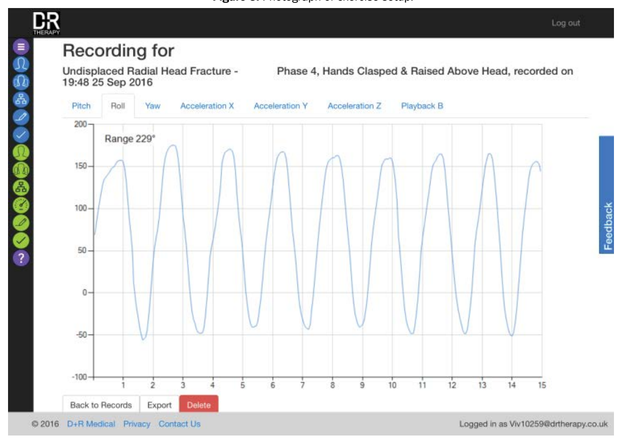
Figure 4. Performance feedback on specific exercise.