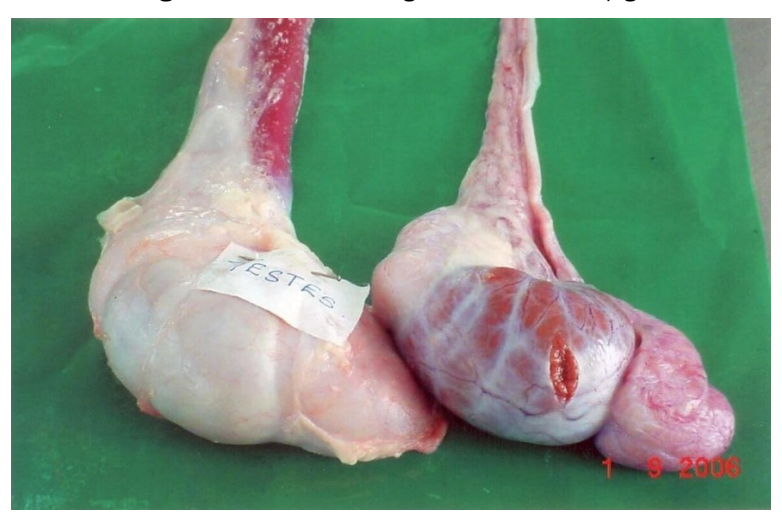
Figure 3: Male external genitalia- Testes in intersex pig.