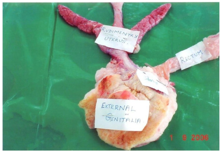
Figure 2: Female internal genitalia in intersex pig.

After humane method of slaughter, the whole pig carcass was opened and the following structures/abnormalities were observed in internal genital organs ( Figures 2 and 3 ). Tissue samples from both ovaries were fixed into 10 percent formalin and paraffinized tissue section were cut into 4 - 6 um thickness and stained with haematoxylin and eosin (HE).