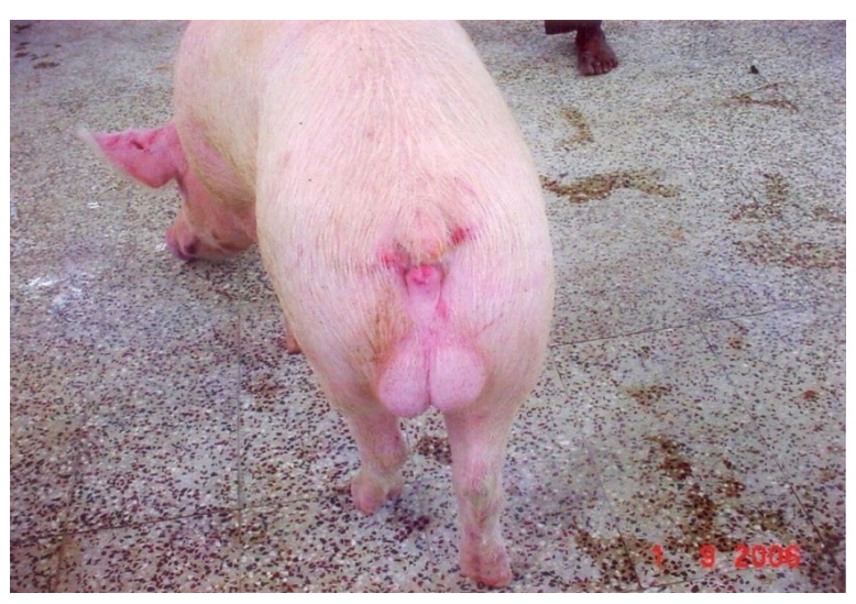
Figure 1: Presence of Scotum and vulva in Intersex LWY pig.

After humane method of slaughter, the whole pig carcass was opened and the following structures/abnormalities were observed in internal genital organs ( Figures 2 and 3 ). Tissue samples from both ovaries were fixed into 10 percent formalin and paraffinized tissue section were cut into 4 - 6 um thickness and stained with haematoxylin and eosin (HE).