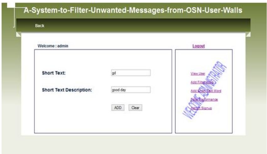
Figure 3.2:Add short-text word

Machine learning (ML) is used as text categorization techniques to automatically assign each short text message within a set of categories based on its content. In machine learning approach, the problem of classification is an activity of supervised learning because the learning step is supervised by the knowledge of the categories. Figure 3.2 shows how admin add the short text word gd and full form of gd i.e. good day in database and whenever any user send that short text word i.e. gd, the full form of that word i.e. good day is display on the receivers wall which is shown in the figure 3.3.