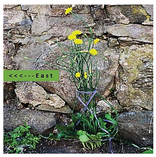
Figure 1b. 24-inch tall (0.6 meter), 12-stem Hypochaeris radicata catsear plant, having penetrated an asphalt-macadam sidewalk. The vertical lift capability of plant estimated at a remarkable 70-lbf (32 Kg). The flowers demonstrate the "positive phototropic effect".