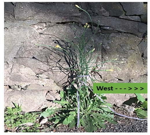
Figure 2. The catsear's photo-sensitive flowers close during the late afternoon hours, from 4 to 6 PM (D S T), demonstrating the phototropic effect. Same plant as shown in Figure 1, during the same day.

enthusiast lawn mowing, officially authorized. N=4 plants are observed that do rotate, so as to follow the sun, and another N=2 plants, once in the shade, close their flowers. In bright sunlight, the flowers, for some reason, close by 4:00 PM. However, on an overcast day, the flowers remain open at 4:00 PM.