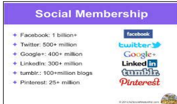
Figure 2-Million Users information on Social Media

Since millions of users are currently active over internet through various social media channels it is quite high time that their information can be easily stolen by a hacker due to even a minor security flaw in web service integrations.