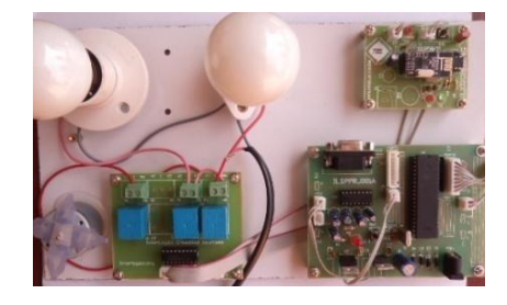
4.3 Receiver side

The intruders entering the room can be counted using the IR sensors that are fixed near the entrance, whenever the intruders enter the room or hall the count will be shown using LCD (Liquid Crystal Display). The temperature sensor is used to control fan based on the temperature. If the temperature exceeds the threshold value the fan will be turned on. The fan will be turned off if the temperature is below the threshold value. The LDR is used to sense the light luminescence and it is used to turn off the devices if the luminescence is high. The multichannel ADC is used to convert the analog values to digital values from Temperature and LDR sensor. The Zigbee is used for wireless transmission between transmitter and receiver.