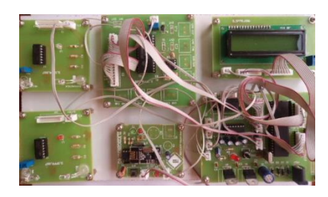
Fig 4.1 Transmitter side

The transmitter contains 8 bit microcontroller, IR sensor, ADC, LCD, Temperature sensor, LDR sensor and Zigbee for transmission.