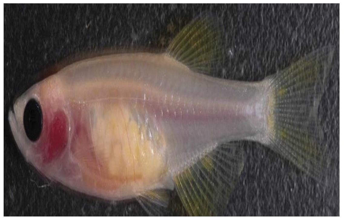
Figure 2. Figure showing transparent zebrafish (Casper line).